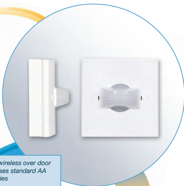
Truly wireless over door unit uses standard AA batteries