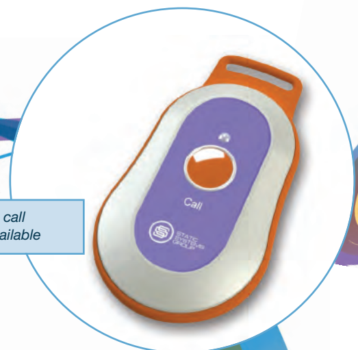
Remote nurse call button also available

Fit for use in a healthcare environment, with time saving features to assist with installation and maintenance.