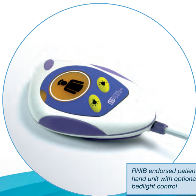
RNIB endorsed patient hand unit with optional bedlight control

The smart sync® protocol means that for the first time wireless battery powered over door units, with full follow-the-light operation, can be used.