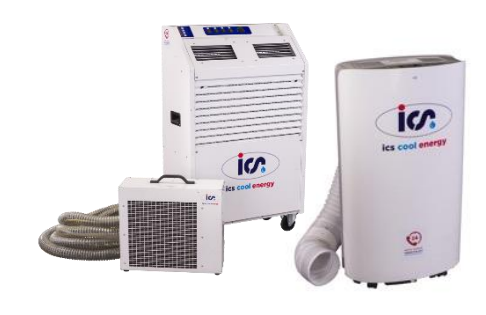
PORTABLE AIR CONDITIONING