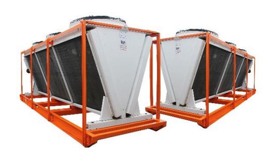
DRY AIR COOLERS & FREE COOLERS 78M3/Hr or 160M3/Hr