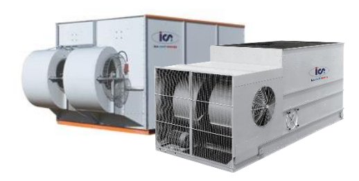
COOLING TOWERS Supporting duties up to 2MW