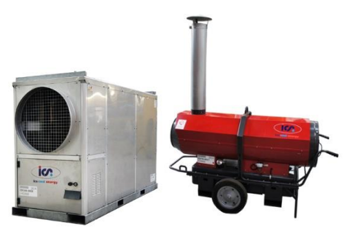
DIESEL HEATERS 70kW, 100kW and 200kW