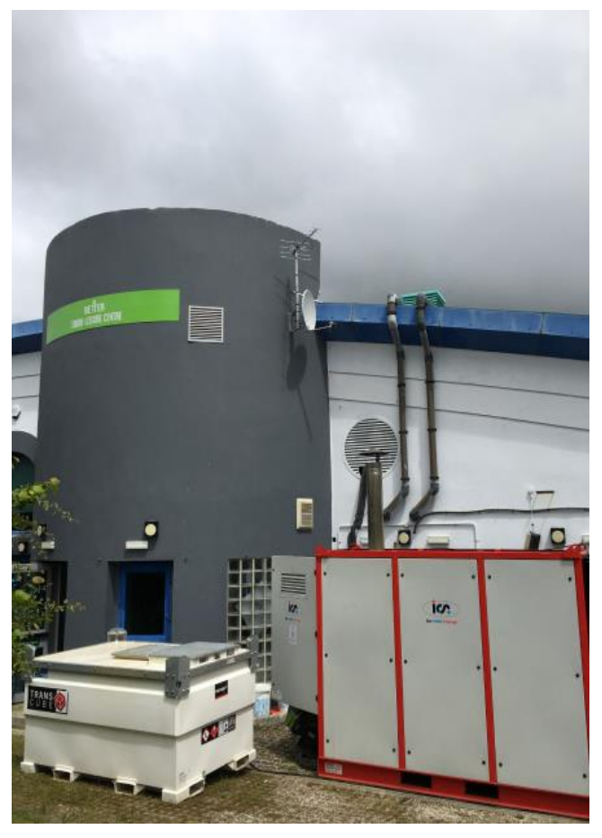
Boiler supplying essential temporary heating to a leisure centre