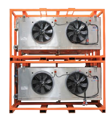
FAN COILS & FAN COILS LT 5kW to 50KW