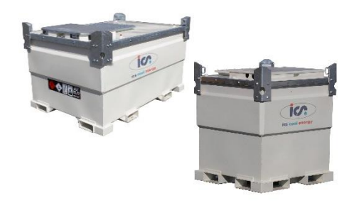
FUEL TANKS 978L, 2900L and 9000L