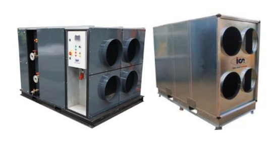
AIR HANDLING UNITS 10kW to 350kW