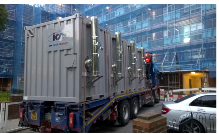
Supporting a block of flats with an urgent district heating requirement