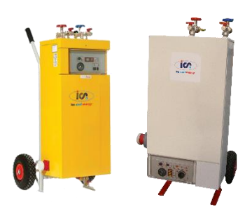
ELECTRIC BOILERS 3KW to 40KW