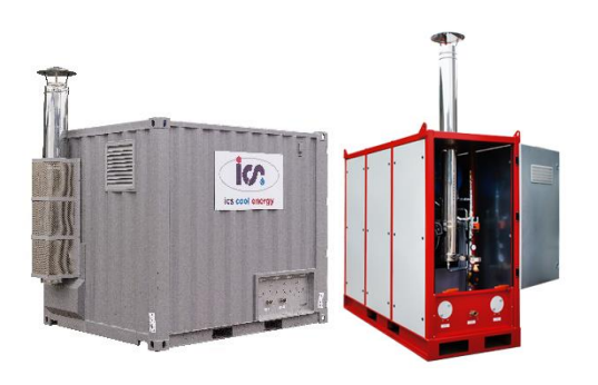
OIL, GAS & STEAM BOILERS Up to 2000kW