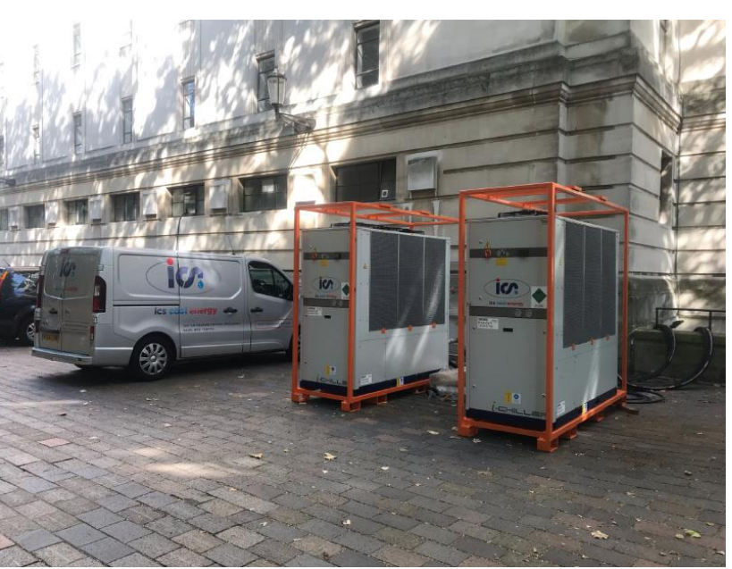
2 chillers feeding air handling units at a well known English University