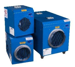
FAN HEATERS 3kW to 42KW