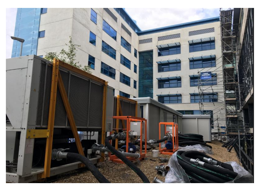
2 emergency chillers supplied, installed and commissioned for a hospital in Wales