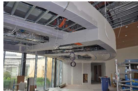
Challenging Round Building