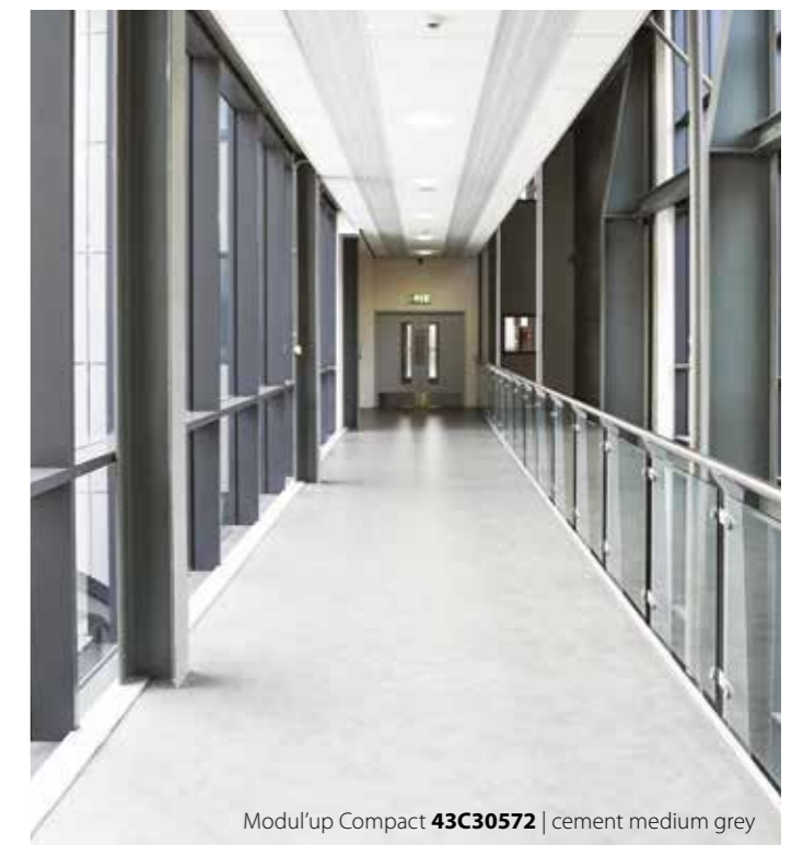
Modul'up Compact 43C30572 | cement medium grey

FLOORING MATERIAL: Modul'up 43C30572 | cement medium grey