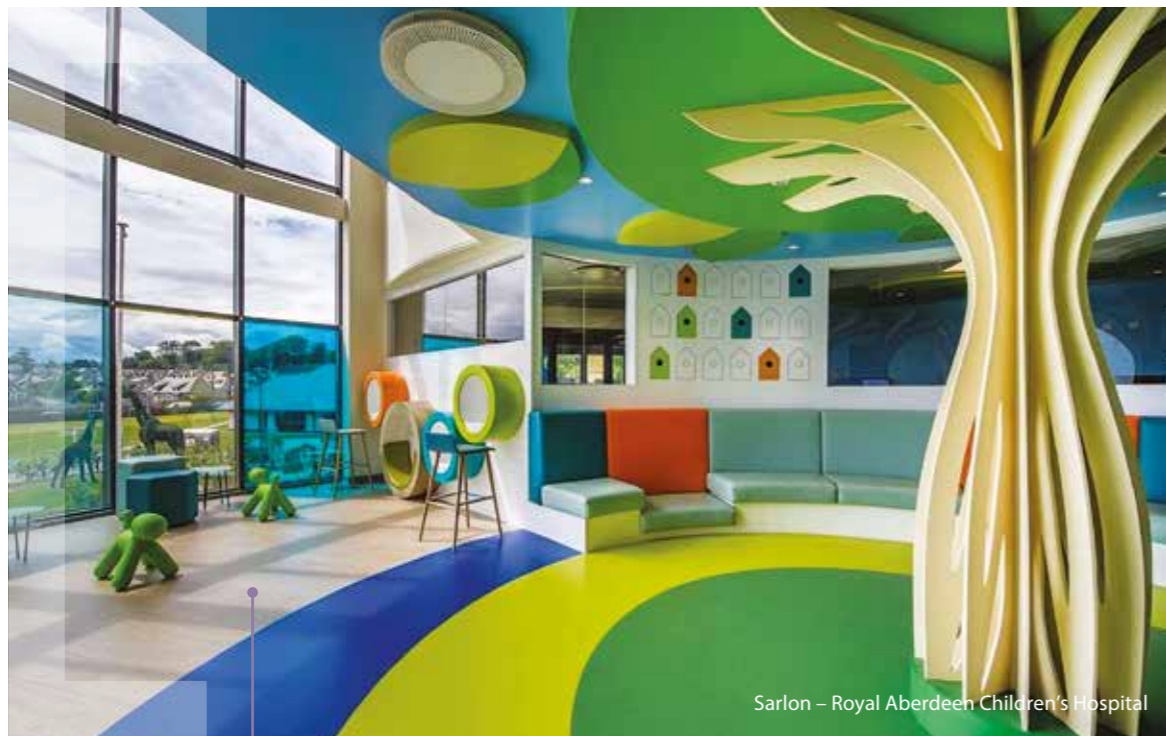
Sarlon – Royal Aberdeen Children's Hospital

See the case study for this project on page 26