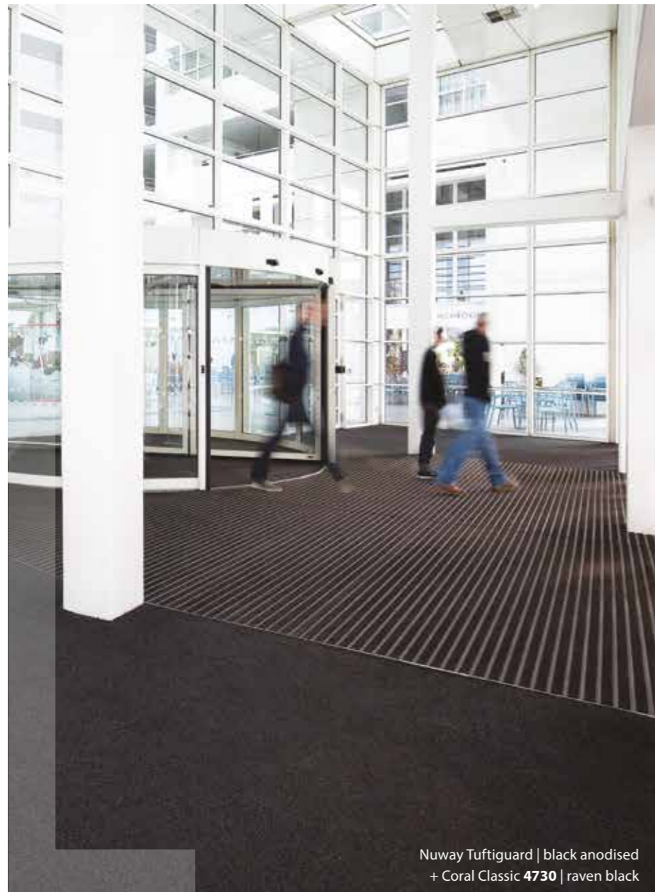
Nuway Tuftiguard | black anodised + Coral Classic 4730 | raven black