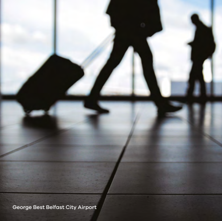
George Best Belfast City Airport