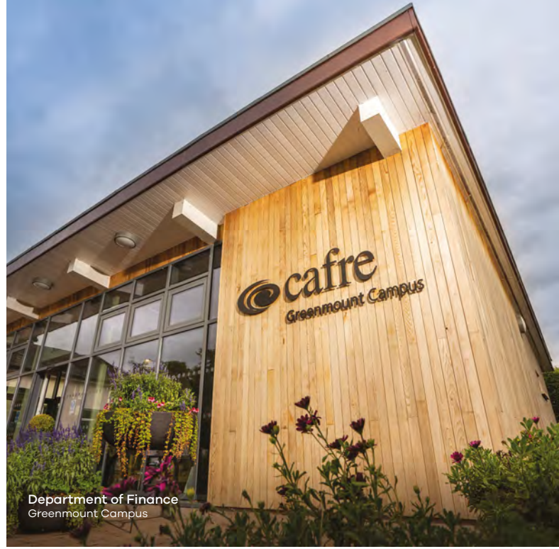
Department of Finance Greenmount Campus