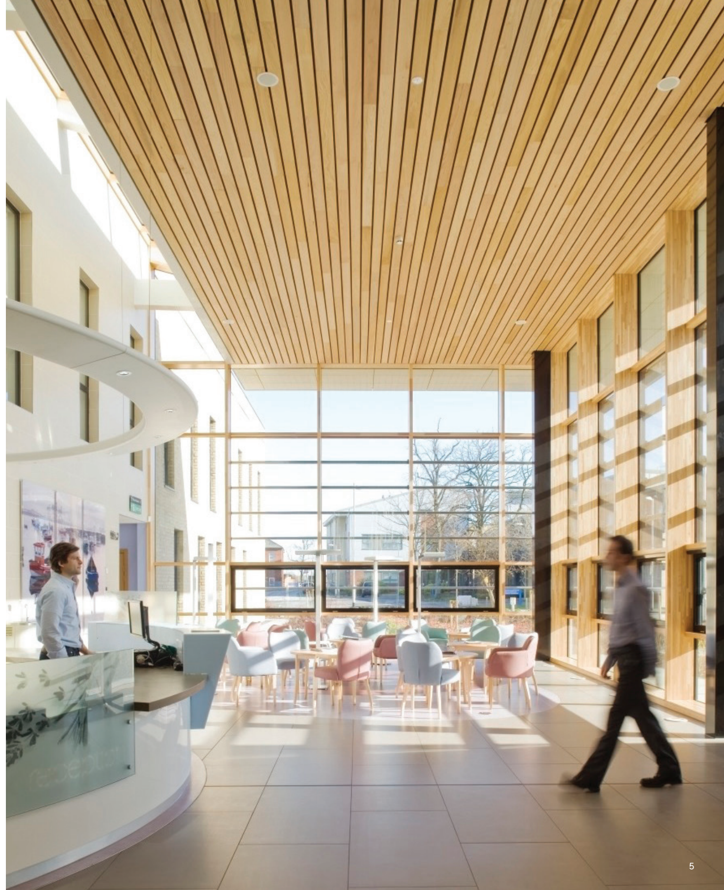
Image: The Endeavour Unit, James Cook University Hospital, Middlesbrough

“The team are flexible and helpful, responding quickly to project needs. They provide a consistently proactive approach to design and problem solving. They value a consultative, partnership approach and engage well with our estates, FM and clinical teams throughout each stage of design. P+HS Architects is a valued member of our supply chain and is expected to remain so for the foreseeable future.”