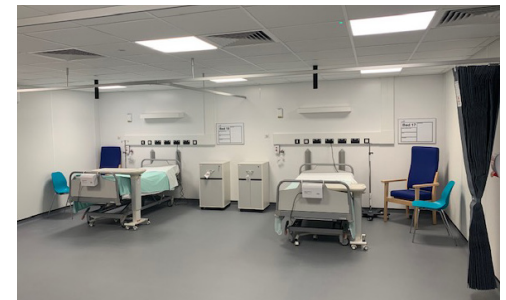
Images, top: Covid ward at Newcastle RVI bottom: Modular ward at North Middlesex Hospital