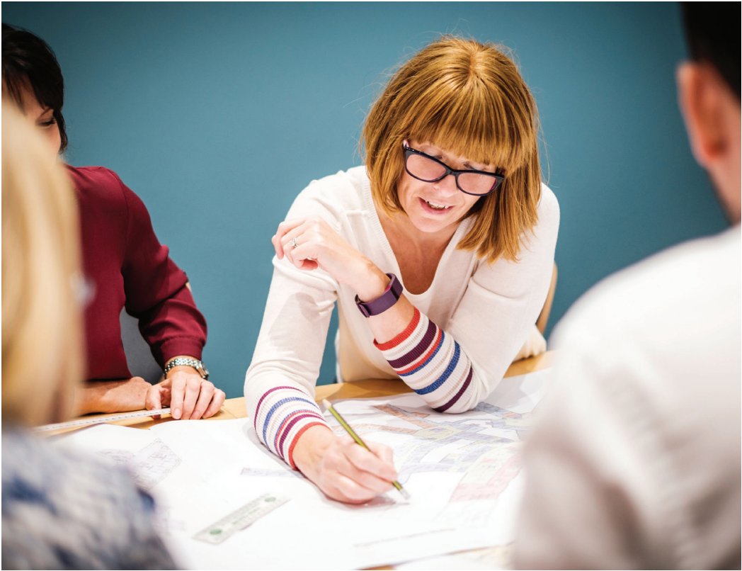
Top: P+HS team Bottom: Northern Cancer Centre, Carlisle

Our teams work nationally and internationally in every aspect of healthcare design for both the NHS and private providers. Services include architecture, interior design, estates rationalisation, masterplanning and project management.