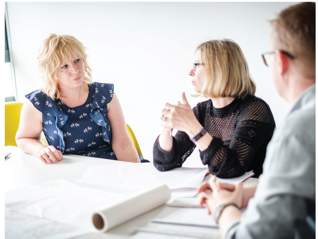
Images: top: Nottingham City Hospital 3D site modeling bottom: Members of the P+HS team