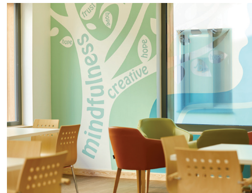
Images, clockwise from top: Kingfisher Court, Haven Court, FitzRoy House