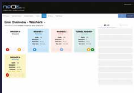
Screen Details - As every customer has different operating requirements, IPR hosts an array of informative screens allowing the user to decide how much information to give operators.

IPR can highlight potential machine issues and provides users with a direct link to our engineers, removing the risk of potential operational issues. Our engineers can be contacted 24/7 via the online chat facility.