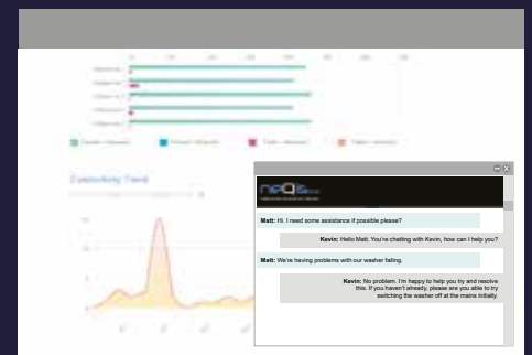
Online Help - Pop up screens ensure that operators are always supported. This can be hosted by neQis or the customer.

To find out more call our team on 07809 702356 or 07738 111 355 Email: info@neqis.co.uk