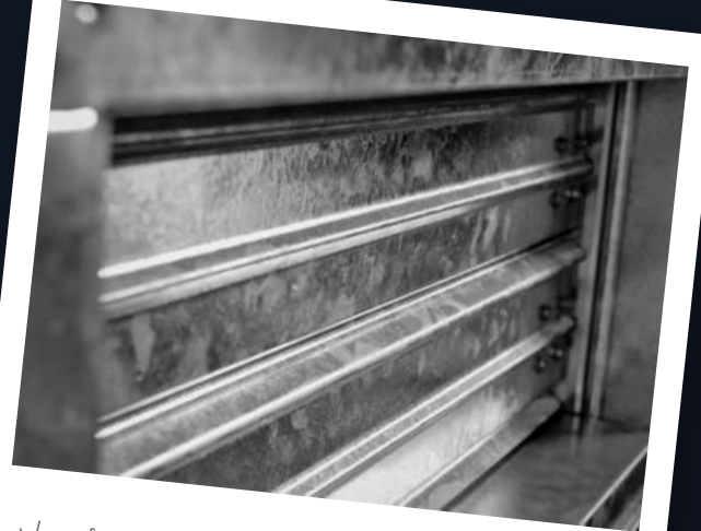
Ventilation Systems Risk Awareness Training

Managers, specifiers and persons responsible for health and safety and the general wellbeing of building users and occupants should be trained to recognise risks related to the ventilation system. They also need to know the remedial action required to be BESA TR19 compliant and other ventilation guidelines.