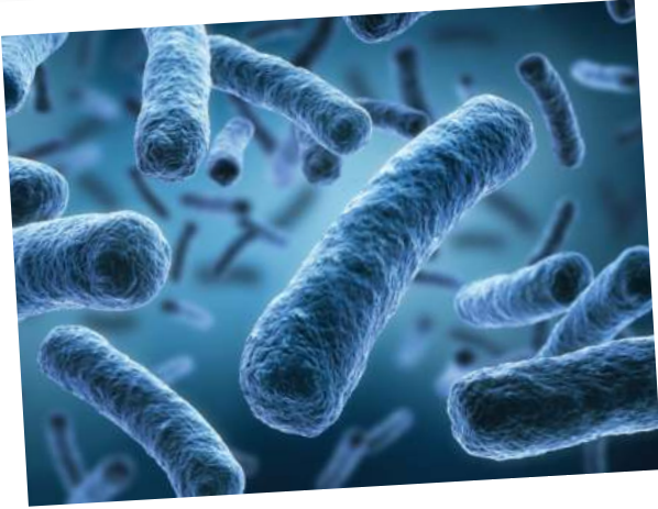
Accredited Legionella training